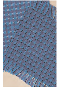
Above: Blackjack weaving samples